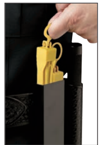
Tri-Fold Cases carry two Tri-Fold Restraints.