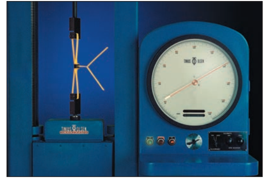
Strength Tested for your safety.