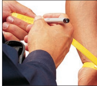
Tri-Folds® feature a recessed identification plate and textured writing surface.