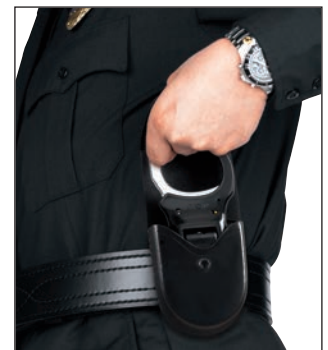
Advanced Technology Cases are specifically designed for the ASP Rigid Handcuff Series of restraints.