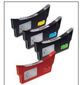
Replaceable Lock Sets are also available in two, three and slip pawl designs.